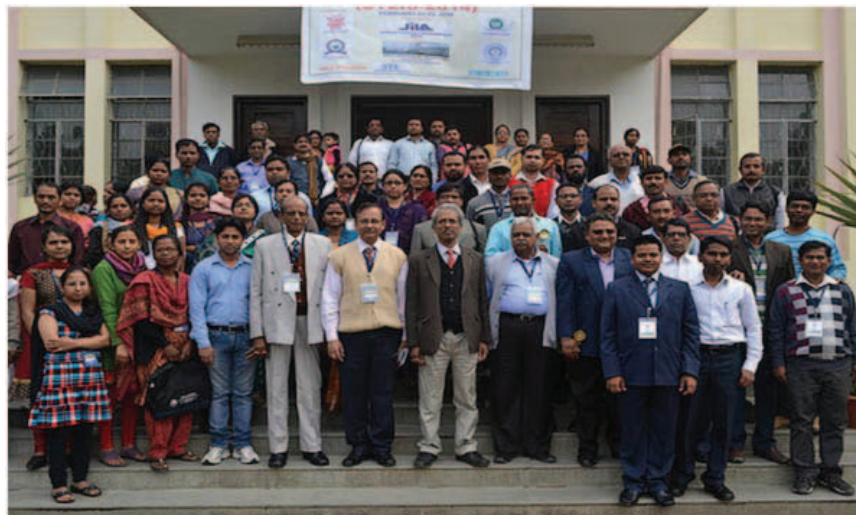
(In JILA Conference)