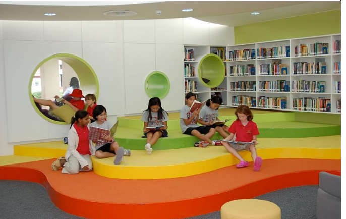
A modern Junior Library