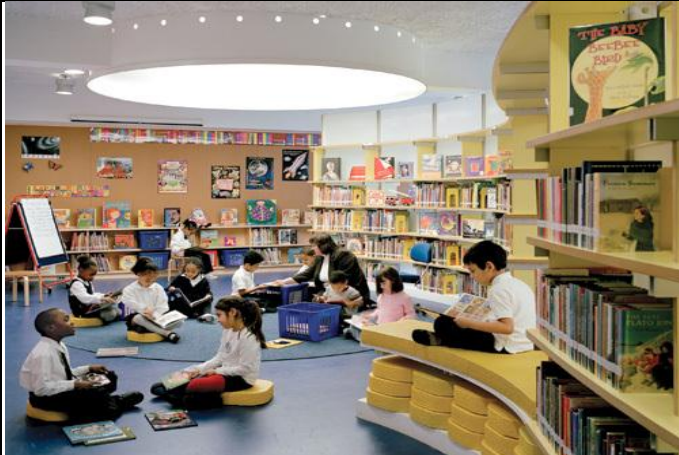
Casual sitting, open shelves, colourful interiors