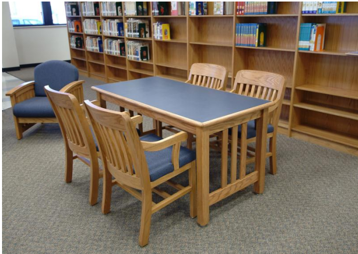
Reading Table with chairs and open shelves