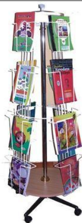
Magazine Stand (revolving)