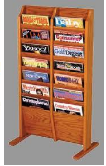
New arrival display stand and magazine rack