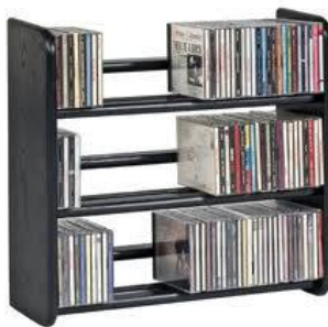
Periodical display rack (pigeon hole type), CD rack (open)