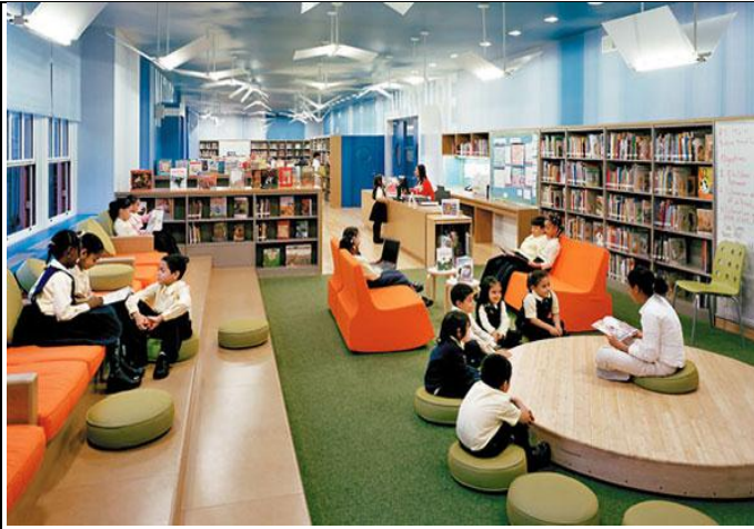
Storytelling and casual reading areas