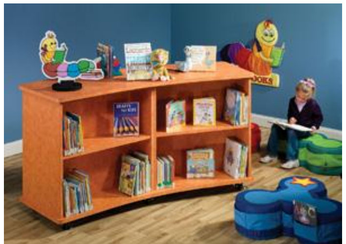
Junior Library Shelf