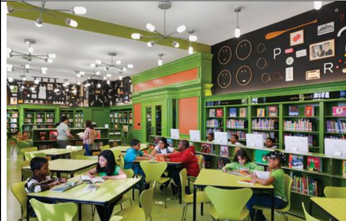
Wall fixtures, lighting and ceiling