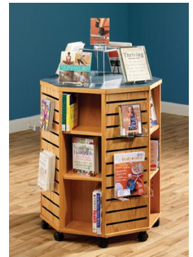
New Arrival display stand