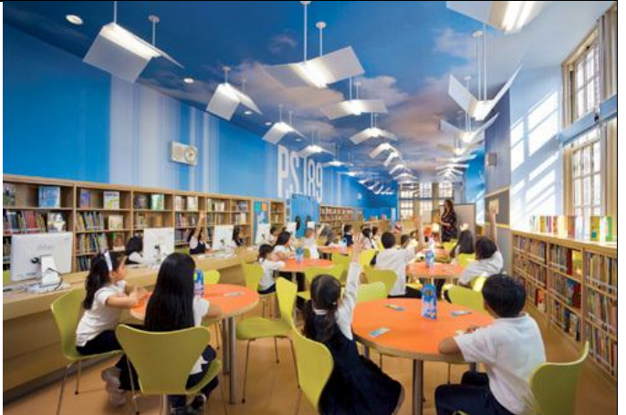
Attractive designs, lighting and open shelves