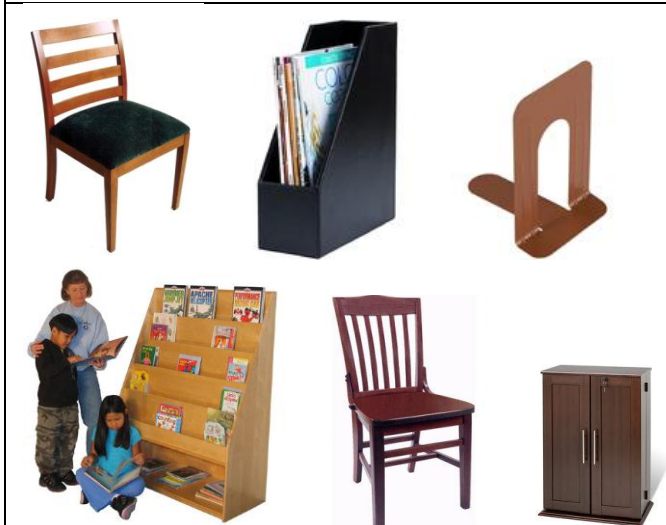
Chairs, Pamphlet Box, Book Support, Display stand, lockable CD rack