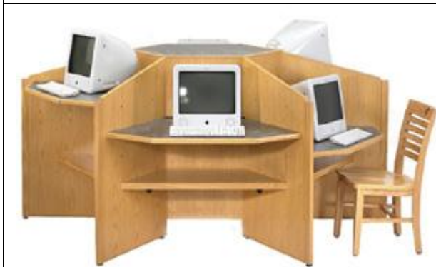
Computer work stations