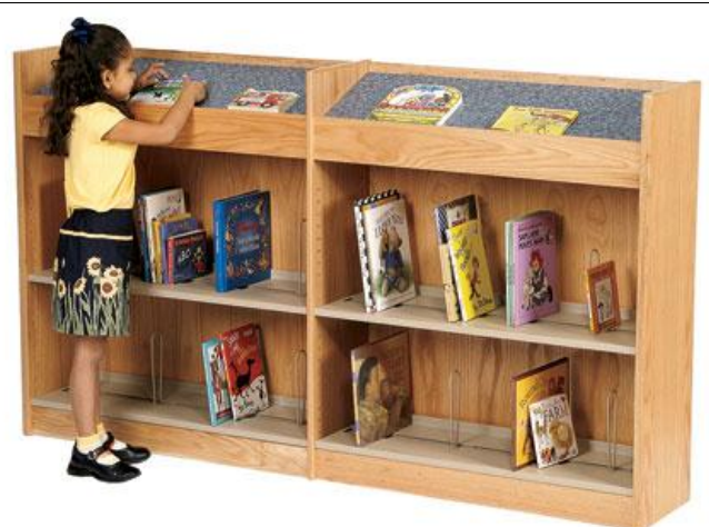
Junior Library Book rack