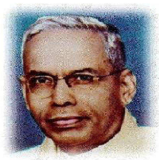
(Dr. S. R. Ranganathan)

(The name does not restrict its scope to Odisha state only; rather it is just a name indicating its place of origin)